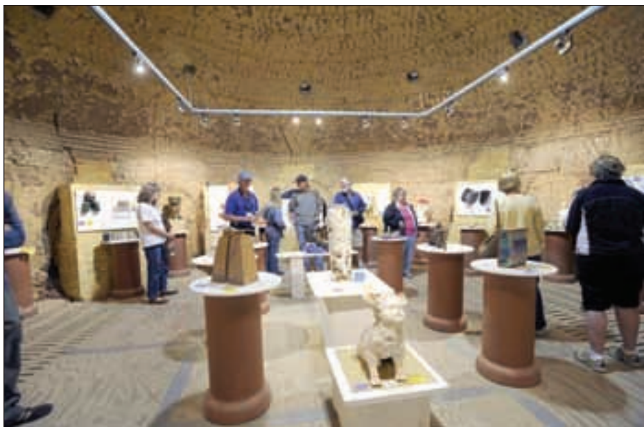
Visitors to Feats of Clay examine artwork being displayed inside a beehive kiln at Gladding, McBean.