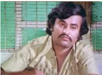
Rajinikanth as depicted in Aarilirunthu Arubathu Varai (1979)