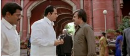
Rajinikanth (right) in Sivaji (2007).

After the Baba debacle, Rajinikanth mulled over numerous scripts with many directors, including K. S. Ravikumar , and finally chose to act in director P. Vasu 's film Chandramukhi . Many people within the industry had written Rajinikanth off after the Baba fiasco, essentially saying "the bloom was off the rose" and that "the gold does not glitter anymore". [22] In essence, many viewed Chandramukhi as Rajinikanth's comeback film, his make or break movie and in the end, when it was released on April 14, 2005, it went on to create new box office records and smashed his own previous records and once and for all removed any doubt within the industry with regards to Rajinikanth's box office clout and incomparable appeal to the masses. Chandramukhi broke the record of being the longest running Tamil film, as of 2007. [23]