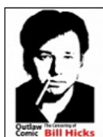
Outlaw Comic: The Censoring...