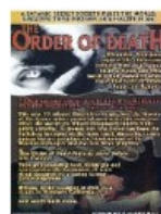
The Order of Death