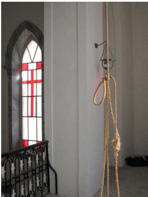
Figure 1: The bell ropes, in the choir loft.

of this mission, and it was the first Protestant church built in what is now Israel-Palestine. 1