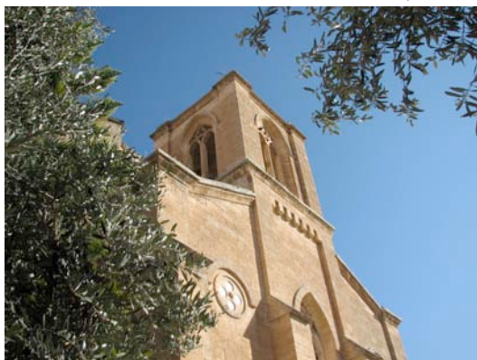
Christ Church Nazareth from the courtyard, with a tower but no steeple. Duane A. Miller ©2011

The diocese started out as a joint venture of the Lutheran Prussian Church and the Church of England, so it was really a Protestant diocese, and not only an Anglican diocese. The Protestant diocese was founded in the 1840's, in the days of the Ottoman Empire, and