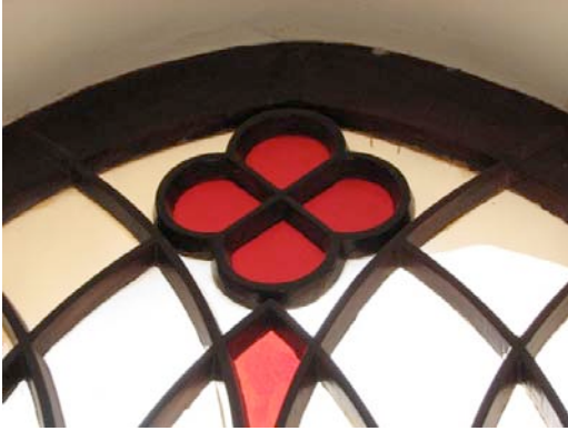
Figure 3: Stained-glass window, detail. (Duane Miller ©2011)

Anglicans, one might say, had church congregations in spite of themselves and yet also because of themselves.” (133)