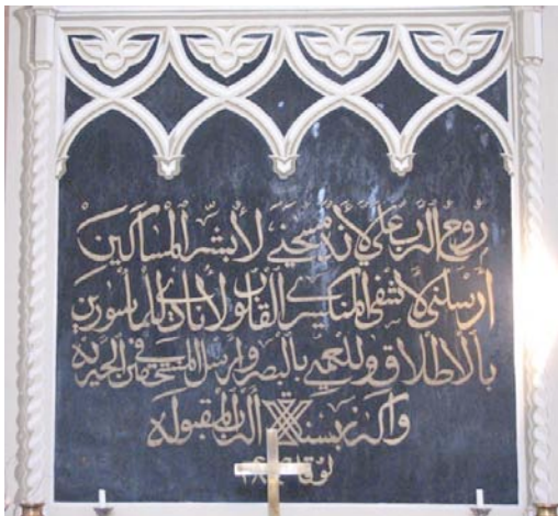
Figure 5: Behind the communion table is this verse in stylized Arabic from Jesus' Nazareth sermon in Luke 4: 'The Spirit of the Lord is on for he has anointed me...'

and there was substantial tension between them and the bishop. In addition to raising funds for and building his own cathedral church, he established his own missionary society—the Jerusalem and the East Mission (JEM).