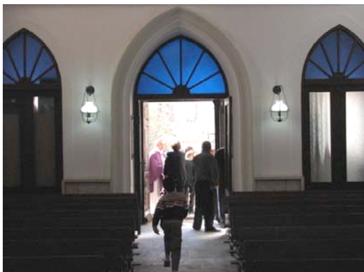
Figure 2: “Go in peace to love and serve the Lord...” The priest greets people as they leave.