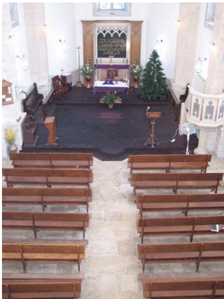
Figure 4: The nave of the church as seen from the choir loft (not used) where the bell ropes are.